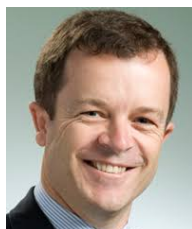
NSW Attorney General, the Hon Mark Speakman SC

The meeting provided the opportunity to update the Attorneys on the UL and the work of the LSC and to discuss the position of other States and Territories in relation to the UL Scheme. The Chair and CEO will meet with the Victorian Attorney General on 6 September in Melbourne.