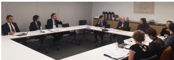
The UL Working Group considers e-conveyancing matters

The meeting provided the opportunity to discuss shared concerns about the risk of hacking resulting in financial loss for consumers and the importance of effective regulation of the operators of e-conveyancing, currently PEXA and Sympli. The Group concluded that whilst there is no identifiable basis for the LSC to take action under the UL, there may be action available to the DLRAs to manage the impact of e-conveyancing, through consultation with the operators and/or legal practitioners.