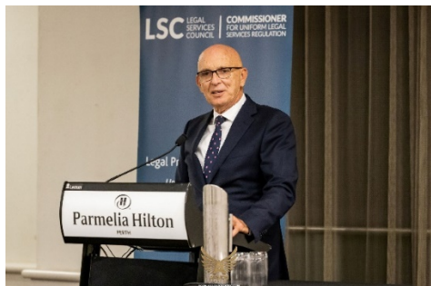
The Attorney General of Western Australia

The Attorney General gave a highly engaging and informative speech that provided insights into his positive views about the Uniform Law scheme, its benefits for the legal profession in Western Australia and the future expansion of the scheme into other jurisdictions.