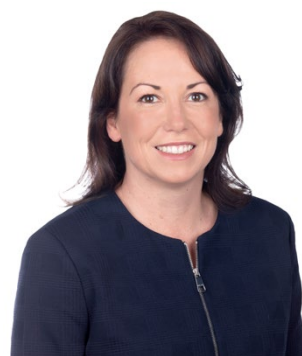
The Honourable Jaclyn Symes MP

The Standing Committee appoints the Council, approves changes to the law and rules that are recommended by the Council and has a general supervisory role over the Council. Through the involvement of the Attorneys General, the scheme ensures that the interests of each jurisdiction are taken into account.