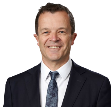
The Honourable Mark Speakman SC MP