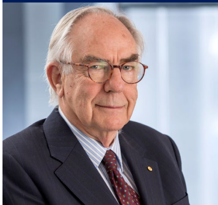
Hon Michael Black AC QC FAAL Former Chair

Chair from 2014 to 2020. Previously, the Hon Michael Black AC QC FAAL was the Chief Justice of the Federal Court of Australia for 19 years, from 1991 to 2010. He commenced practice at the Victorian Bar in 1964 and was appointed Queen's Counsel in 1980. During his outstanding career, he has held various academic, committee and international appointments.